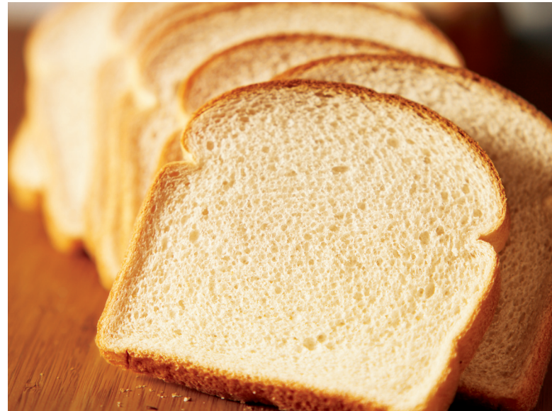
Ultragrain is included in numerous recent product introductions, including breads, pastas, crackers, cookies, breakfast breads, mixes and many more.

For the first time, consumers can enjoy everything from breads to pasta, pizza dough, cookies, crackers and even pastries—all with the benefits of whole grain nutrition. For technical assistance in formulating with Ultragrain, call 402-595-4282.