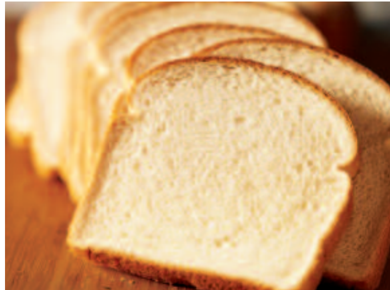
Ultragrain is included in numerous recent product introductions, including breads, pastas, crackers, cookies, breakfast breads, mixes and many more.

For the first time, consumers can enjoy everything from breads to pasta, pizza dough, cookies, crackers and even pastries—all with the benefits of whole grain nutrition. For technical assistance in formulating with Ultragrain, call 402-595-4282.